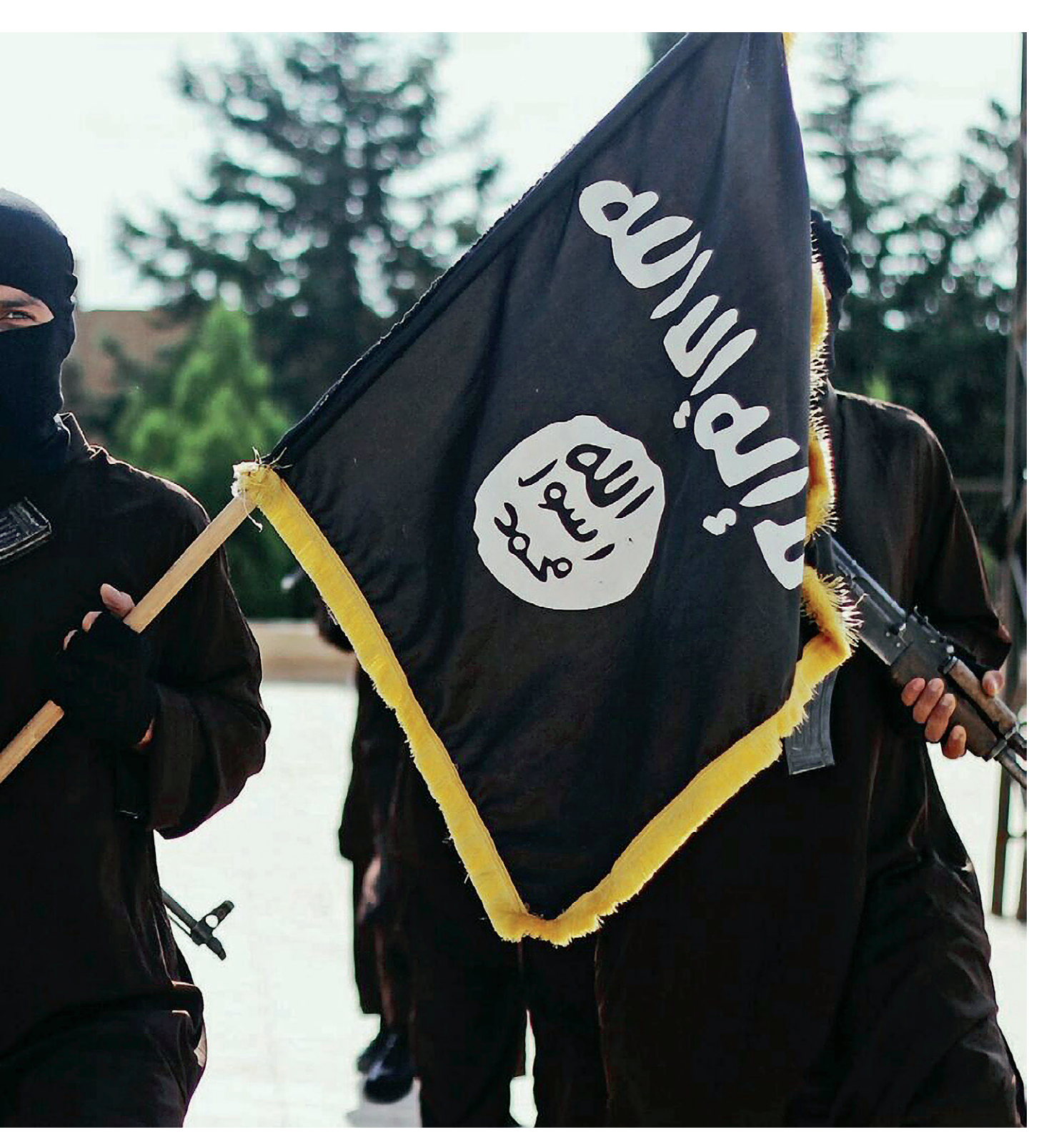
ILLUSTRATION ~ Propaganda photo of ISIL.