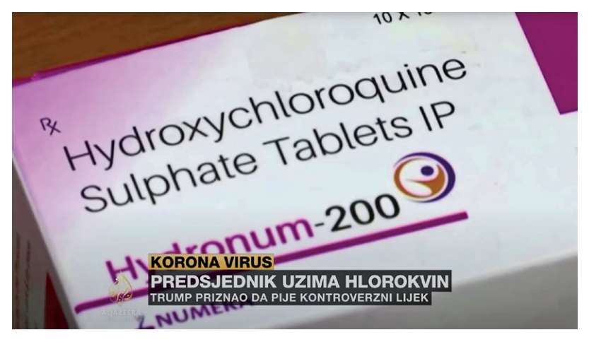
ILLUSTRATION ~ USA: Withdrawal of approval for the use of antimalarial drugs (hydroxychloroquine and chloroquine) in the treatment of COVID-19 (June 15, 2020).

It is obvious that there is a feeling among the broad masses that they have been left behind by elites who are corrupt and flirt with the political and economic power for their own benefit. All kinds of elites no longer have authority because the masses feel that they have given birth to their problems, fears and hopes, thus opening up space for others who will fill that void. The ignorant betrayed by the learned now lead themselves.