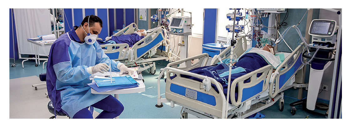
ILLUSTRATION ~ Hospital in the atmosphere of Covid 19. ILUSTRACIJA ~ Bolnica u atmosferi Covida 19.

ne of the manifestations of contemporary jāhiliyyah is the growing trend of the rise of anti-intellectualism in the world. Education, but also science itself, art and the thirst for knowledge are no longer valued. They are increasingly being replaced by entertainment as the sole object of occupation, ignorance, omniscience and self-sufficiency, as well as deliberate stupidity and consciously designed dumbing down of the masses. The COVID-19 pandemic and the way we, as humanity, have responded to it has pushed this frightening trend of anti-intellectualism to the fore. Also, it has shown all the power and appeal of a superficial, conspiracy theory-prone as well as an anti-scientific movement for uneducated masses. This conspiracy is empowered by social networks where people can easily bind themselves to create "alternative facts" but also an alternative reality.