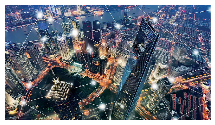
ILLUSTRATION ~ The internet infrastructure is simply a network of networks. ILUSTRACIJA ~ Internetska infrastruktura jednostavno je mreža mreža.

Nicholas Carr in his book "Shallow"<sup>14</sup> from 2010, writing about what the internet is doing to our brains as one of the sweeping changes in the way most people think and experience the world, he sees overexposure to the internet and the virtual reality social media world. He writes about how media are not only information channels. They provide people with material for thinking, but also shape the thinking process.