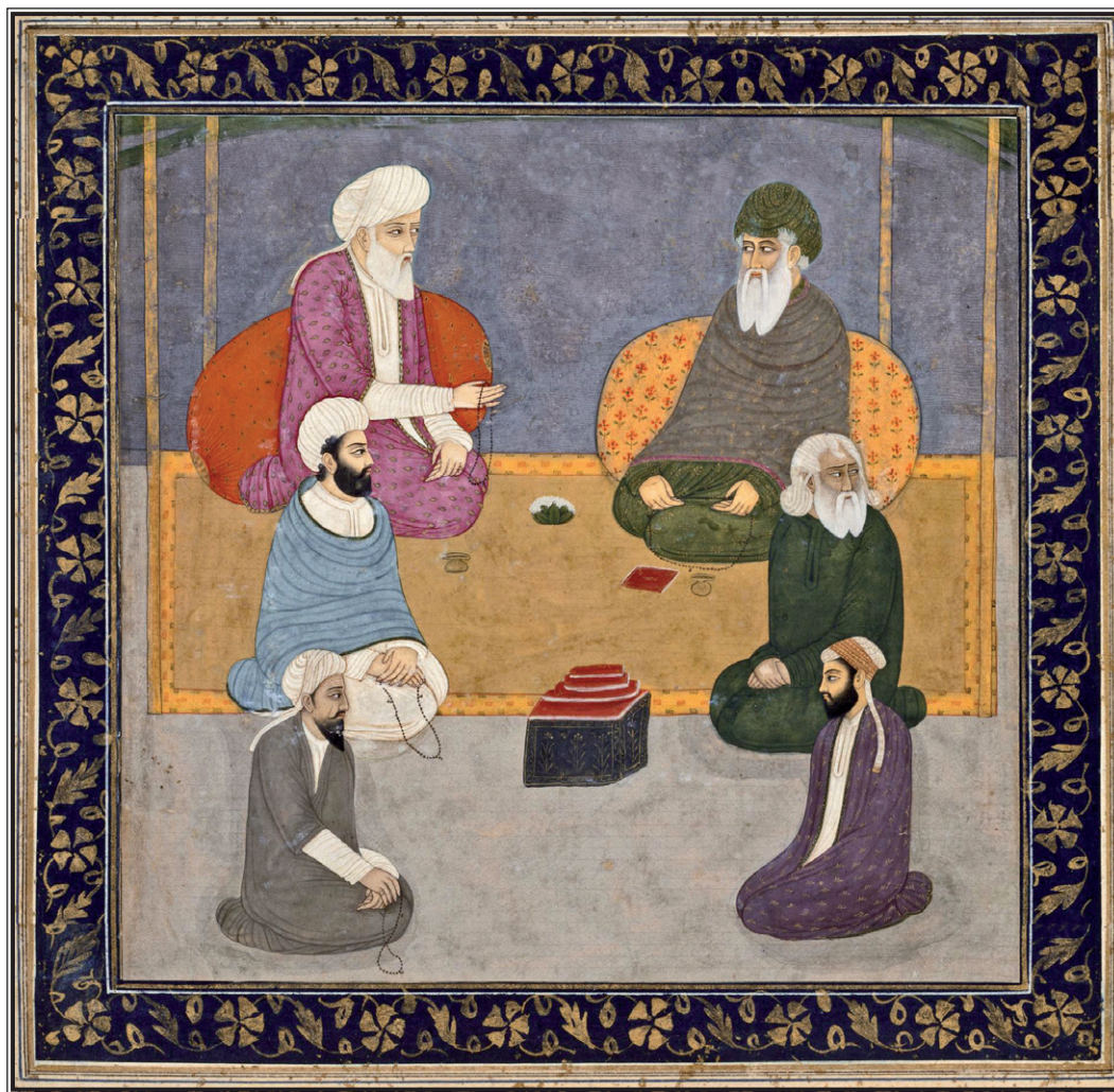
ILLUSTRATION ~ Six Muslim philosophers, miniature, India 17 th century. ILUSTRACIJA ~ Šest muslimanskih filozofa, minijatura, Indija 17. stoljeće.

Neoplatonic metaphysics. ▼5 Rudolph's point seems to be that despite using philosophical terminology and concepts, they do not impact the structure of his system. One of the aims of the present chapter is to show that, at least for al-Māturīdī's theory of properties, these elements run deep.