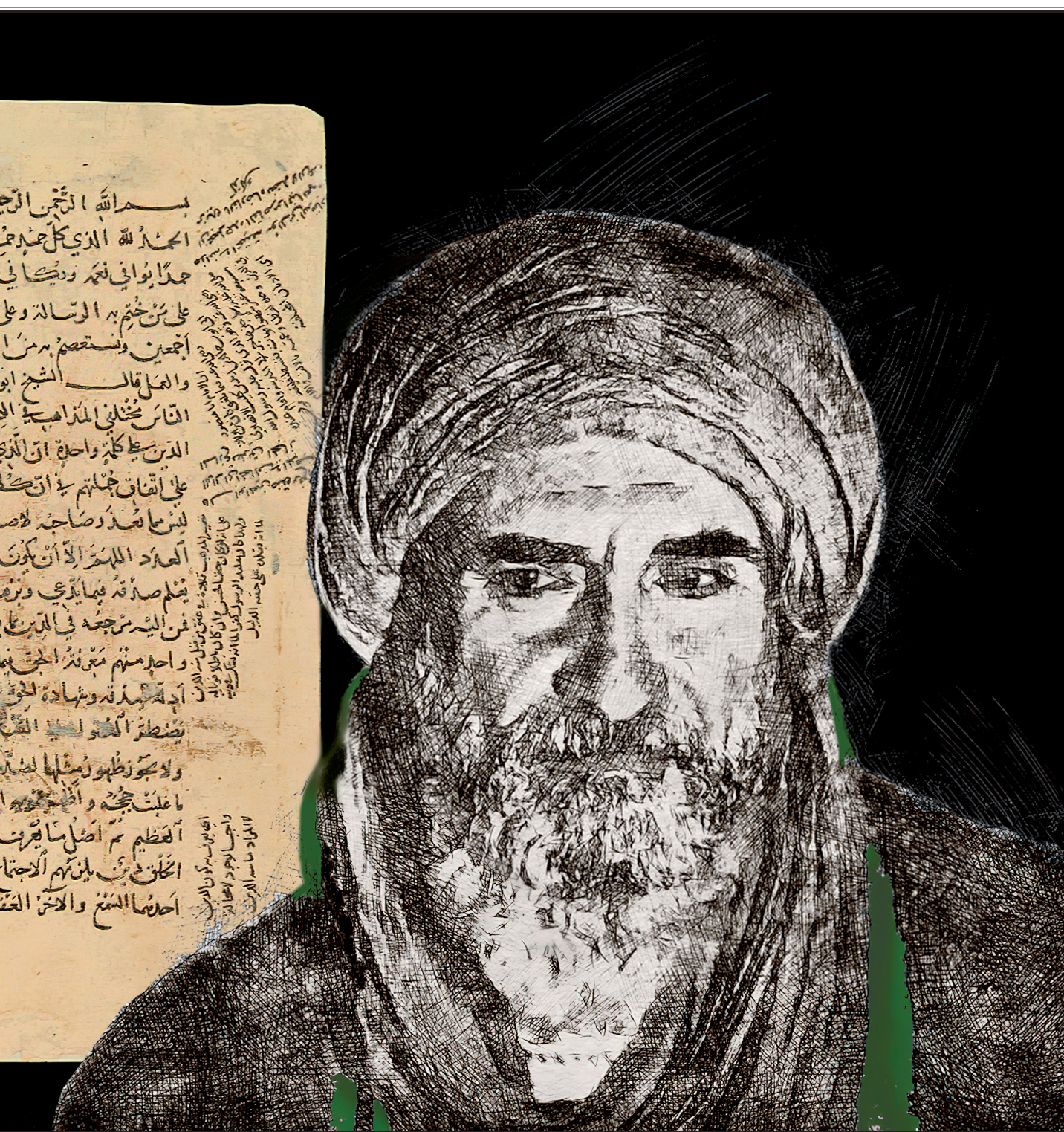
ILUSTRACIJA - Al-Māturīdī and his work Kitāb al-tawhīd. The first two pages of the book. Creative Commons Public Domain License, identifier msadd3651, identifier-ark ark:/1396O/t1xd9vz97.