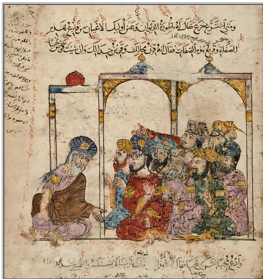
ILLUSTRATION ~ Lecture of a philosopher. Maqamat al-Hariri, early 13 th century. © Gallica.bn.fr / Arabe 6094./06. ILUSTRACIJA ~ Predavanje jednog filozofa. Maqamat al-Hariri, početak 13. stoljeća. © Gallica.bn.fr / Arabe 6094./06.

Greek texts to be rendered into Arabic by the litterateur Ibn al-Muqaffa' (d. 757), or his son, in the mid second/ eighth century.▼ 14 Accordingly, al-Māturīdī classifies reality into the category of substance (' ayn '), by which he means a concrete particular, and the category of quality ( ṣifa ), the attribute or property possessed by it.▼ 15