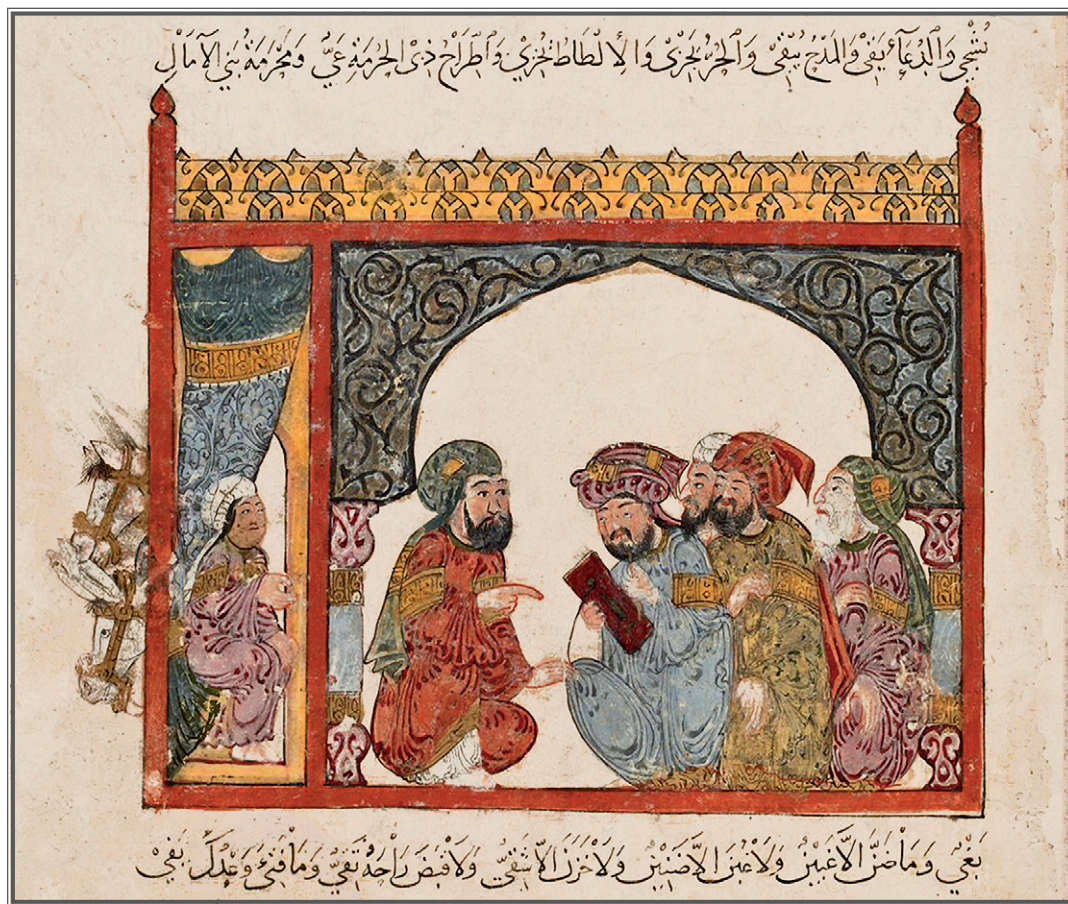
ILLUSTRATION ~ The agreement of the philosophers before leaving to visit another region. Maqamat al-Hariri. ©Gallica.bn.fr / Arabe 6094/84.

description, which is incoherent. Such criticism of the meta-qualification of attributes ( waṣf al-ṣifa ) had been discussed prior to this. For instance, it is ascribed to the ninth-century theologian Abū al-‘Abbās al-Qalānīsī. ▼ 29 Al-Māturīdī’s response to this critique is that it is not problematic for real property instances to be given a kind of temporary attribute when they are described, so long as it disappears thereafter. This would seem to make property concepts linguistic abstractions that refer to their real counterparts.