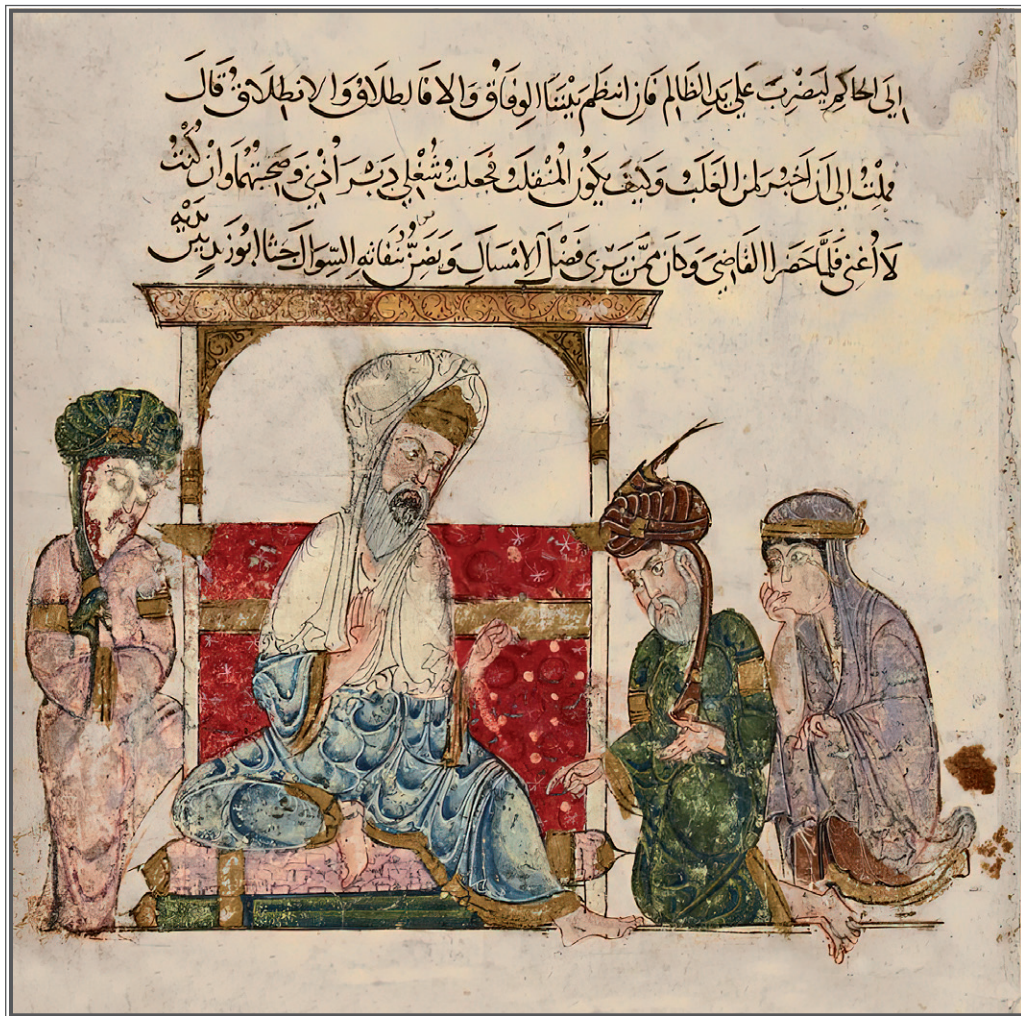
ILLUSTRATION ~ A philosopher in dialogue with a kadiya/judge. Maqamat al-Hariri, early 13 th century. © Gallica.bn.fr / Arabe 6094/139.

Then [al-Ka'bī] objects on account of it thus being permissible that there is for the attribute an attribute. [Al-Māturīdī] says: yes, with the meaning that it is being described, but that is only in existence as long as the one describing it is speaking. When he stops speaking, it no longer exists. ▼ 28